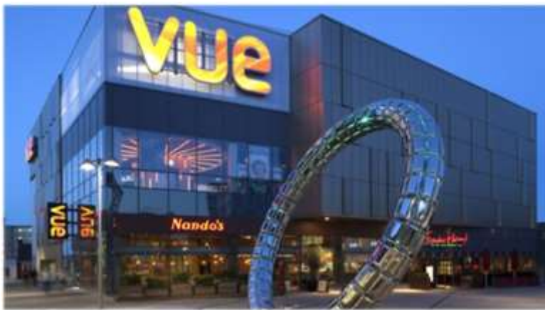
London-based Vue Cinemas operate over 200 theatres throughout the UK and the European Continent

See also: The Six Best Indie Movies to Watch Out for This Year (The Atlantic)