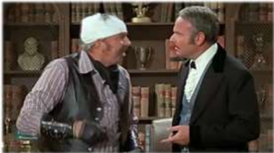
"...There must be a waaaaaaaaaaaaaay..." - Harvey Korman as Hedley Lamarr in Blazing Saddles Click to Play

In 1974, 60 years later to the day, Warner Bros. held the world premiere of Mel Brooks' Blazing Saddles at the Pickwick Drive-In Theater in Burbank. The 250 invited guests watched the film