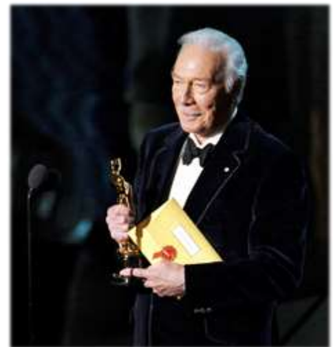
Christopher Plummer Accepting an Oscar at the 2012 Academy Awards

Actor Christopher Plummer died on Friday at the age of 91, after a career that spanned seven decades performing in film, television and on stage. His most iconic role came early, starring alongside Julie Andrews in the 1965 musical The Sound of Music . Plummer was quite bothered that this role as Captain von Trapp would come to define his career with the public, since he himself did not think much of the film, describing it as bordering on "mockishness." Plummer was a prodigious talent, one of only two dozen actors to have achieved the "Triple Crown of Acting" with wins at the Academy, Emmy and Tony Awards. His 2012 Oscar as Best Supporting Actor for his performance in Beginners made Plummer the oldest actor ever to win an Academy Award in a competitive category. Plummer was also celebrated for his versatility, playing many dramatic and comic roles at all stages throughout his career.