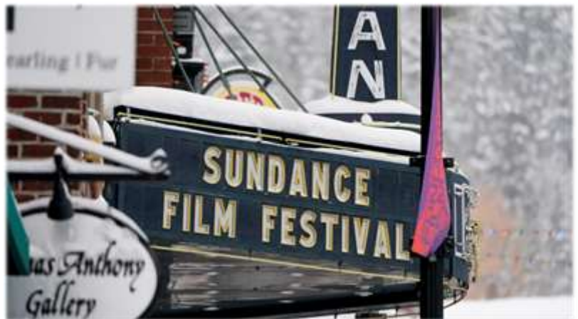
The Marquee of Park City's Egyptian Theatre on Thursday, Jan. 28, 2021.

Last Tuesday, the 2021 Sundance Film Festival wrapped up after 6 days of on-line screenings with an Awards Night presentation held before a very limited in-person audience at the festival's traditional setting in Park City, Utah, broadcast over the Internet to at-home movie fans. This year's mostly-virtual format was forced by the risks of holding large in-person gatherings, lest they become super-spreader events. Festival organizers were able to maintain many of the Sundance traditions. Siân Heder's Coda was the biggest winner, taking home the jury prize for best director, best ensemble