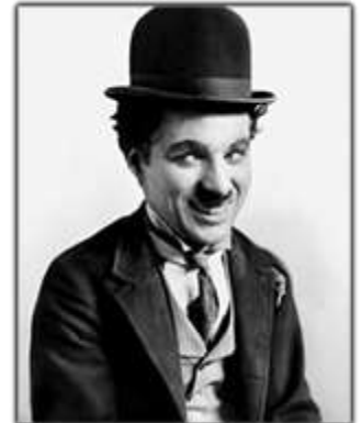
Chaplin's The Little Tramp Click to Play