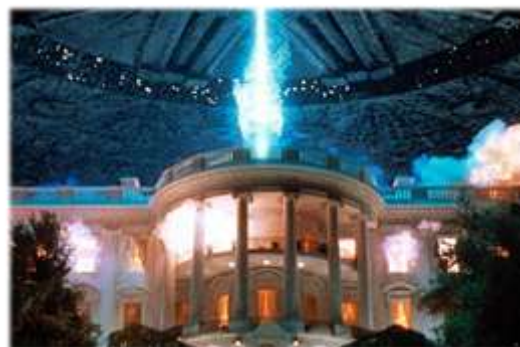
This Famous Teaser Trailer for Independence Day aired during Super Bowl XXX in 1996

This time last year, the soon-to-be-released blockbusters that were feted with an advertising spot during the Super Bowl were: Fast & Furious 9, No Time to Die, Black Widow, Top Gun: Maverick and A Quiet Place Part II . What a difference a year makes? Will a parade of movie trailers at this Sunday's Super Bowl signal a thaw in the freeze on studio releases? The most likely candidates to be teased are Universal's thriller Old from director M. Night Shyamalan (opening in theatres on July 23 rd ), Amazon's comedy sequel Coming 2 America starring Eddie Murphy (streaming on Amazon Prime beginning March 5 th ) and Disney, perhaps, with another bite at Black Widow (opening in theatres on May 7 th ). The upcoming debut of the Paramount+ streaming service is also expected to be featured, as well as HBO Max promoting its generous slate of 2021 movies and series.